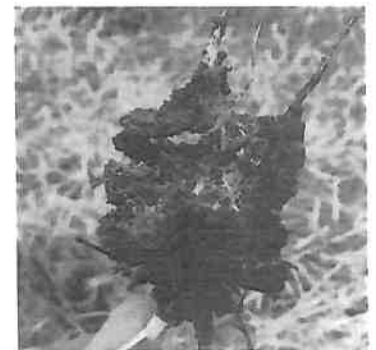
Decomposing clubroot gall

Infected roots will eventually disintegrate, releasing resting spores into the soil, which may then be transported by wind, water erosion, animals/manure, shoes/clothing, vehicles/tires, or earth tag on agricultural or industrial field equipment. The clubroot pathogen, in the form of resting spores in the soil, can be moved any way that soil can be moved. Activities that move large volumes of soil (such as on agricultural or industrial field equipment) between areas or regions are considered to have the highest risk.