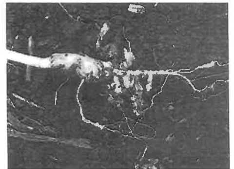
Clubroot infected canola root with intact clubroot galls

Clubroot is a soil-borne disease caused by a microbe, Plasmodiophora brassicae ( P. brassicae ). Clubroot affects the roots of host plants, which include cruciferous field crops such as canola, mustard, camelina, oilseed radish and taramira, and cruciferous vegetables such as arugula, broccoli, Brussels sprouts, cabbage, cauliflower, Chinese cabbage, kale, kohlrabi, radish, rutabaga and turnip. Cruciferous weeds (e.g. stinkweed, shepherd's purse, wild mustard) can also serve as hosts for the clubroot pathogen.